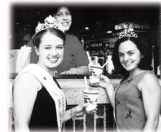
2005 State Fair Gopher Dairy Bar Statistics: