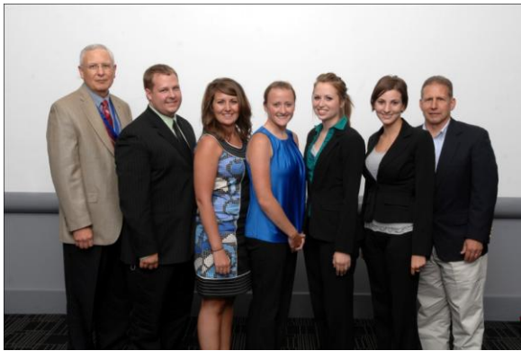
University of Minnesota 1st Place Website 3rd Place Chapter Yearbook