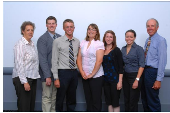
Cal Poly 2nd Place Dairy Quizbowl