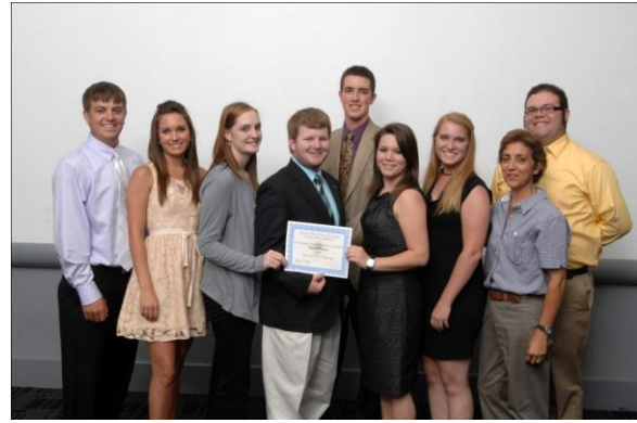
Louisiana State University 3rd Place Chapter Award 3rd Place Chapter Display