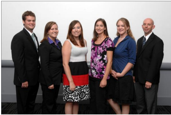
Virginia Tech 2nd Place Chapter Award 2nd Place Chapter Scrapbook