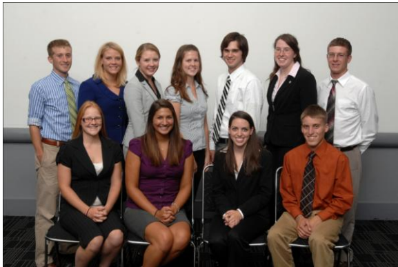
Penn State University 1st Place Chapter Award 1st Place Dairy Quizbowl 1st Place Chapter Yearbook 1st Place Electronic Yearbook Team 2nd Place Website 2nd Place Chapter Display 3rd Place Chapter Scrapbook Chapter with the most miles traveled