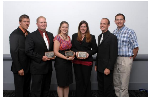
Iowa State University 2nd Place Electronic Yearbook Team 1st Place Chapter Scrapbook 1st Place Chapter Display 2nd Place Chapter Yearbook 3rd Place Website