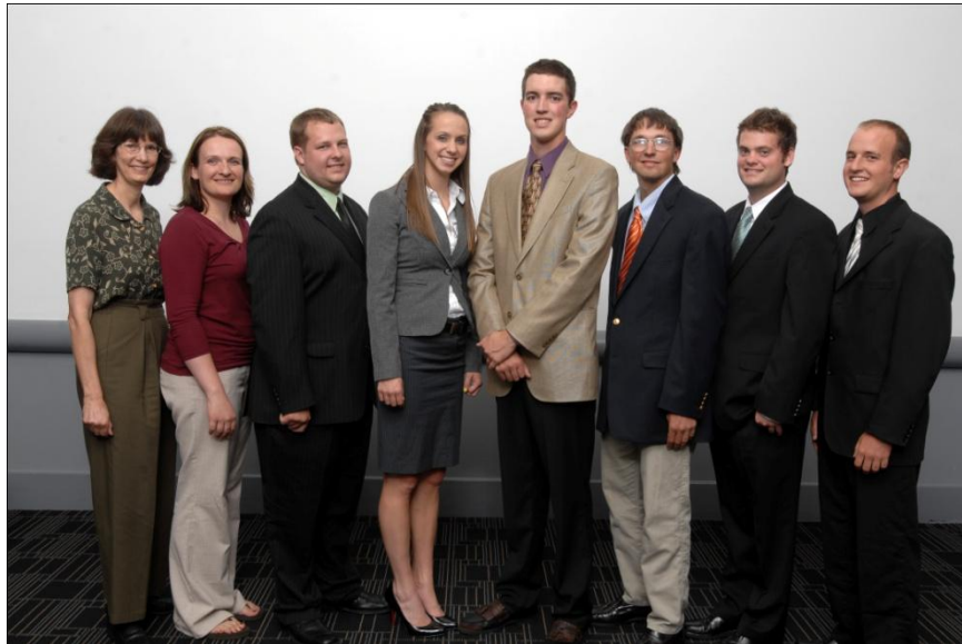
2010-2011 SAD Officer & Advisor Team (L-R)