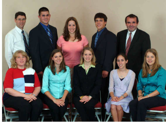
First Place Outstanding Chapter Award Penn State University