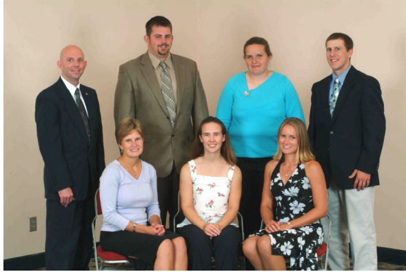
1 st place Chapter Scrapbook, Yearbook and Website Competition Virginia Tech